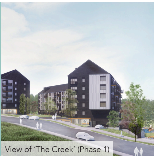
View of 'The Creek' (Phase 1)