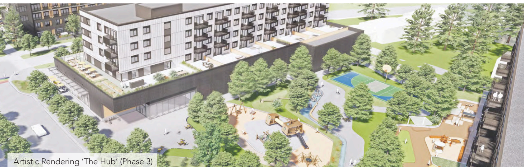
Artistic Rendering 'The Hub' (Phase 3)