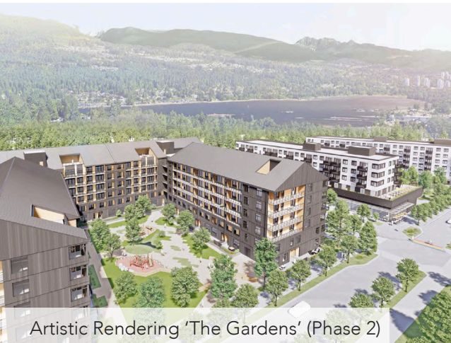
Artistic Rendering 'The Gardens' (Phase 2)

Watch out for more news in the Fall as we prepare for an Open House to talk about Public Art with the community.