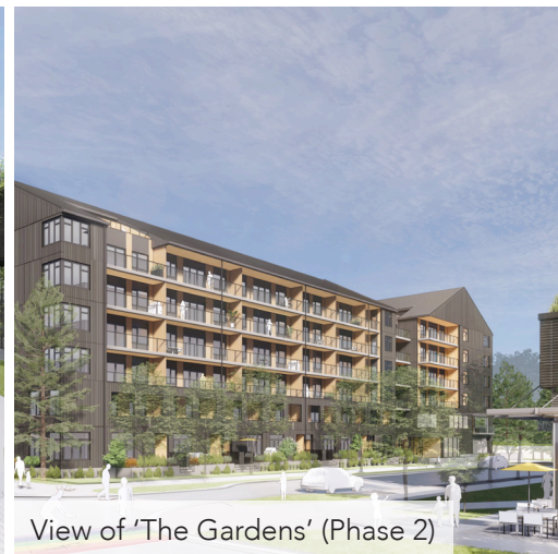
View of 'The Gardens' (Phase 2)