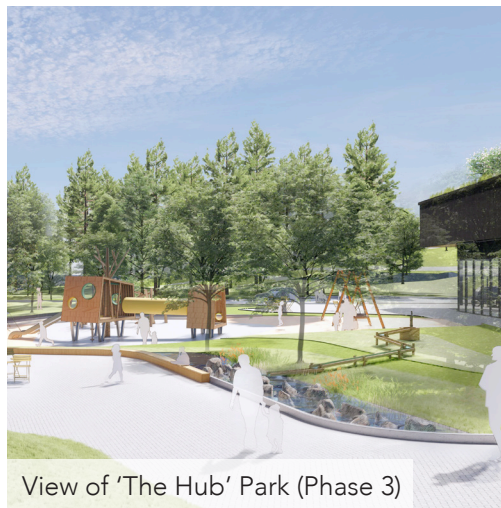
View of 'The Hub' Park (Phase 3)